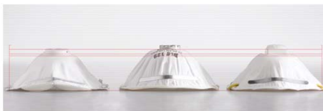
Filtering facepieces passed Dolomite dust clogging test. Lower breathing resistance, higher duration

In order to reduce the chance of product contamination (required by various industries among which the pharmaceutical and the food industries), the internal noseclip is set between two layers of fabric to reduce as much as possible the aluminum parts of the PPE